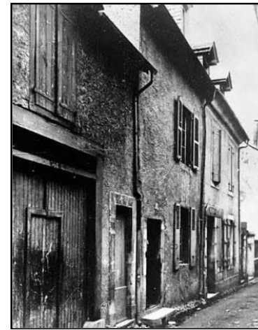
Le Cachot (The Dungeon)

When Bernadette's mother found out, she beat her because she thought she was lying, and forbade her from returning. But Bernadette couldn't stay away; she felt an irresistible pull towards the grotto.