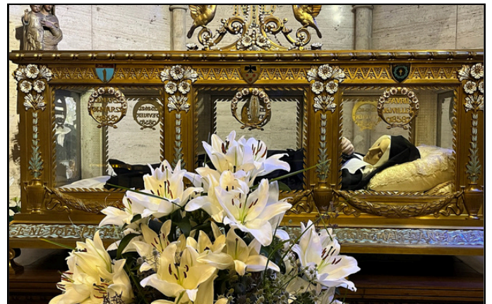
St. Bernadette's incorrupt body is displayed in the main chapel of the Convent of Saint-Gildard in Nevers, France (Espace Soubrious Nevers).

Bernadette was canonized in 1933. She is patron of the sick, the poor, and those mocked for their faith. Her feast day falls on the day of her death, April 16, 1879.