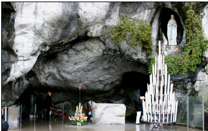
The grotto, present day.

Throughout the 18 apparitions, which ended on July 16, 1858, Bernadette was examined by doctors, clergy, and police. She was ridiculed by townspeople, doubted by family, and threatened by officials. She never changed her account, enduring all with quiet resolve that surprised those who questioned her.